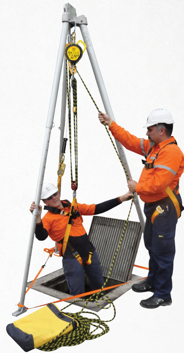
Dual retrieval/SRL models can be easily mounted to tripods.