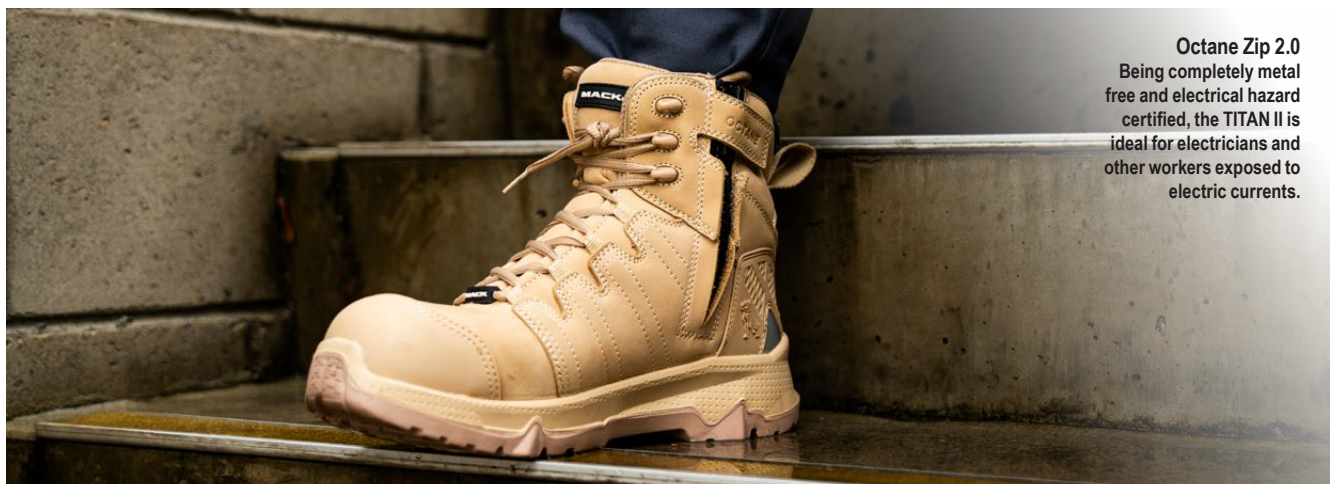
Octane Zip 2.0 Being completely metal free and electrical hazard certified, the TITAN II is ideal for electricians and other workers exposed to electric currents.